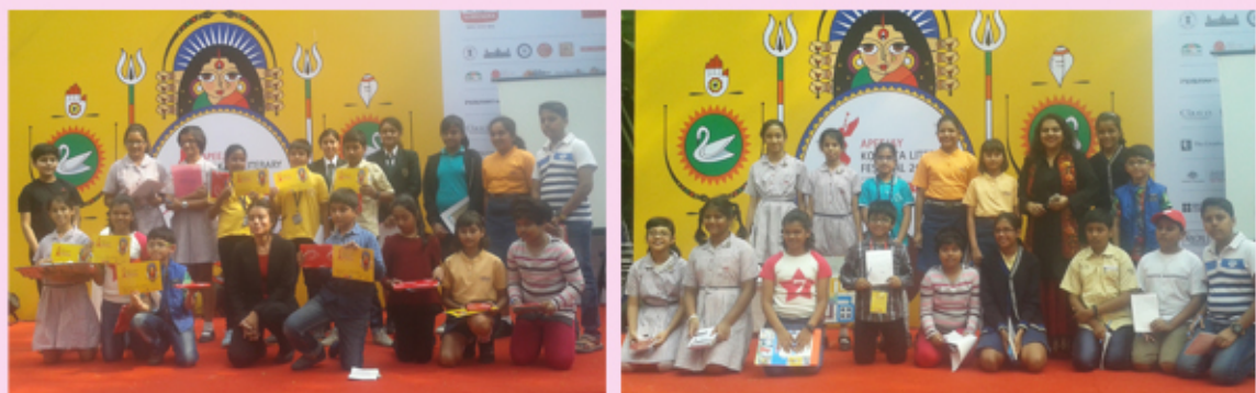
Children participated in "Pix a tale" and "Rhyme time" competition.

Children from the junior department took part in the "Kolkata Literary Festival 2016", which was held in the Apeejay House.